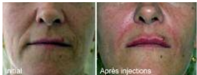
Image 5: Treatment of the upper lip and nasolabial wrinkles using the combined technique. Straight after injections of revitalising solution and fillers, cutaneous tissues regain their brightness, and the filling effect is immediate, but a slight erythema has also appeared.