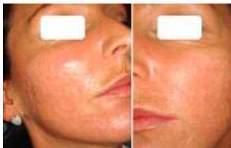
Image 2: Straight after 'nappage' of the cheeks with a revitalising solution, you notice traces of numerous papules, at 1 cm intervals.

It is also possible to perform these injection sessions with a small size cannula to achieve a genuine 'bio-revitalisation'. It isn't strictly a mesotherapy because there are no multiple cutaneous punctures, but it provides the skin with the necessary nutritive elements with a much reduced number of entry points.