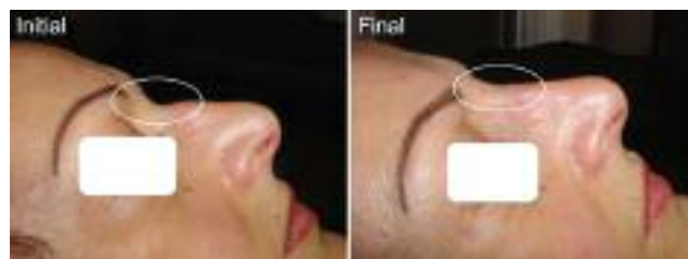
Image 6: Filling of a deep set hollow at the base of the nose, through subcutaneous injection of a substantial volume of dermal filler (reticulated hyaluronic acid X-HA Volume).

Alongside this polyvalent tool, we also use X-HA-Volume (Filorga, Paris, France), a version twice as viscous as this hyaluronic acid (because more reticulated). This product restores an important volume by subcutaneous injection; it treats volume losses linked to aging and sculpts the face naturally and without surgery. The zones treated in particular are the cheeks, cheekbones, chin, face contour, temporal zone and the base of the nose (6). Face contour can be remodelled, volumes can be restored and deepest wrinkles can be treated. Injections are always deep, epidermal, subcutaneous or supraperiosteal.